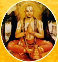
Sri Bhagavad Ramanujacharya